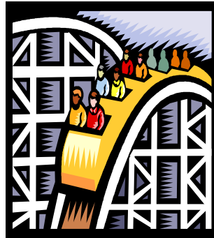
8th Grade Class Trip June 2nd